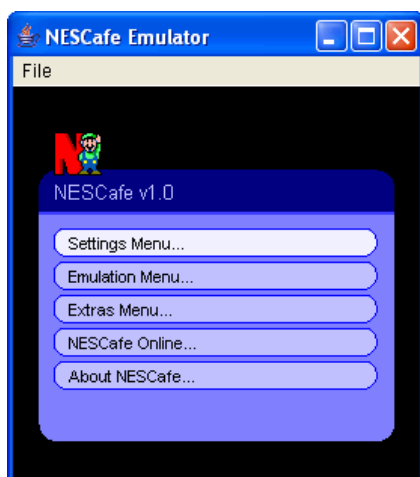
The NES Cafe Main Menu (press ESC to access)

If you are using the Standard version, you can load a new game from the File Menu. Click on the Load Rom menu item on the File Menu and a File Open dialogue box will be displayed, allowing you to select the ROM (Nintendo Game) that you want to load. The game will then start running in the main window.