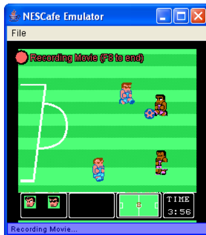
Recording a Game