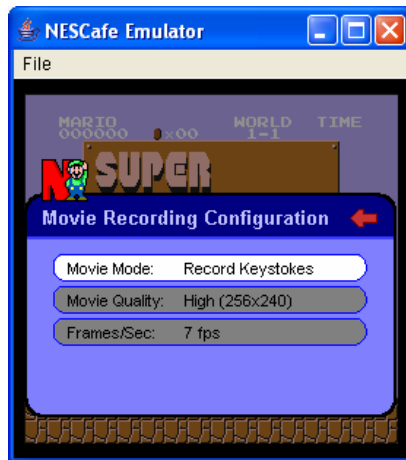
Configuring the Recording Format for Movies