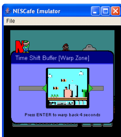
NES Cafe Time Shift Buffer Screen (press Back-Space)

The Save State Screen of the Emulation menu is shown on the left. You can Save a State into one of the available slots for each game. When you go to Load a previously saved state you can cycle through the available slots by pressing the UP and DOWN arrows on your keyboard.