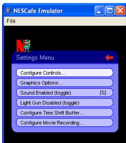
NES Cafe Settings Menu Screen