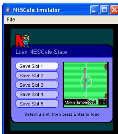
Playing a Movie Back